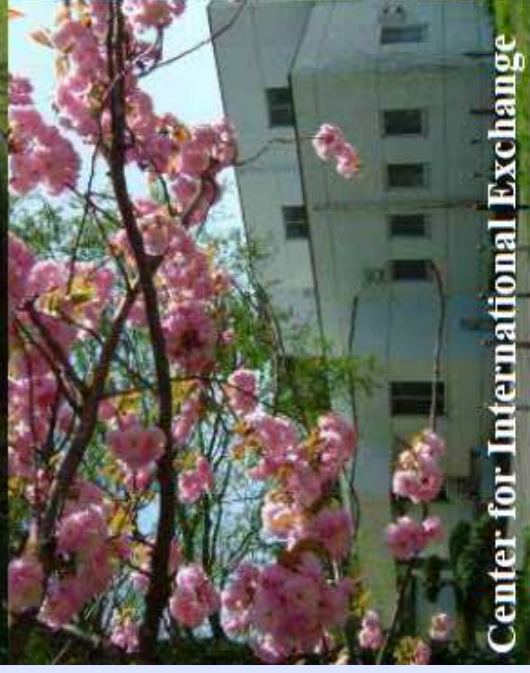
Center for International Exchange