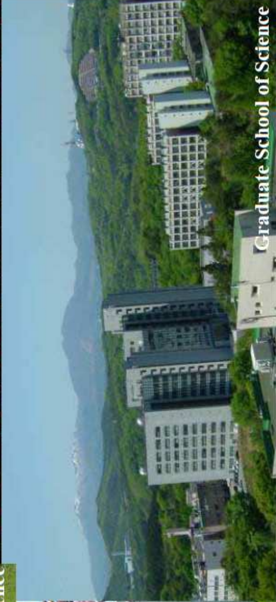
Graduate School of Science