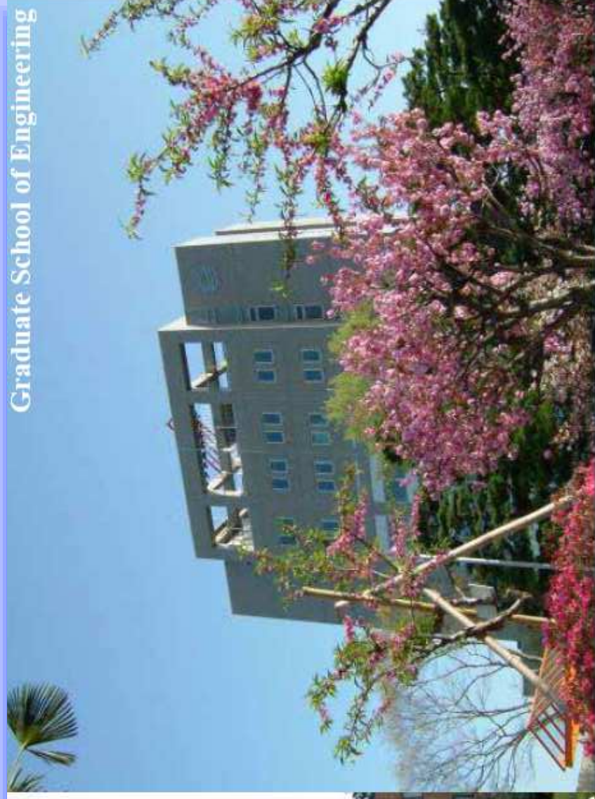
Graduate School of Engineering