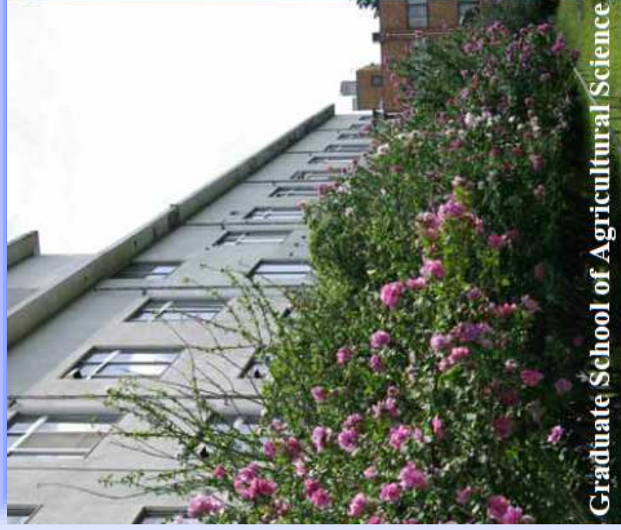
Graduate School of Agricultural Science